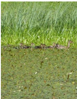
If you are very quiet try to see the ducks