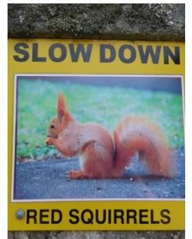
Find a real red squirrel

Less than 6 points Try again another day!