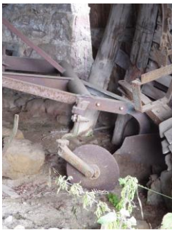
Vintage Plough – its very near the pond