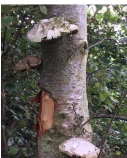
Horse Shoe Fungus