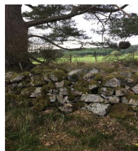
Dry stone dyke- Where did all the stones come from?